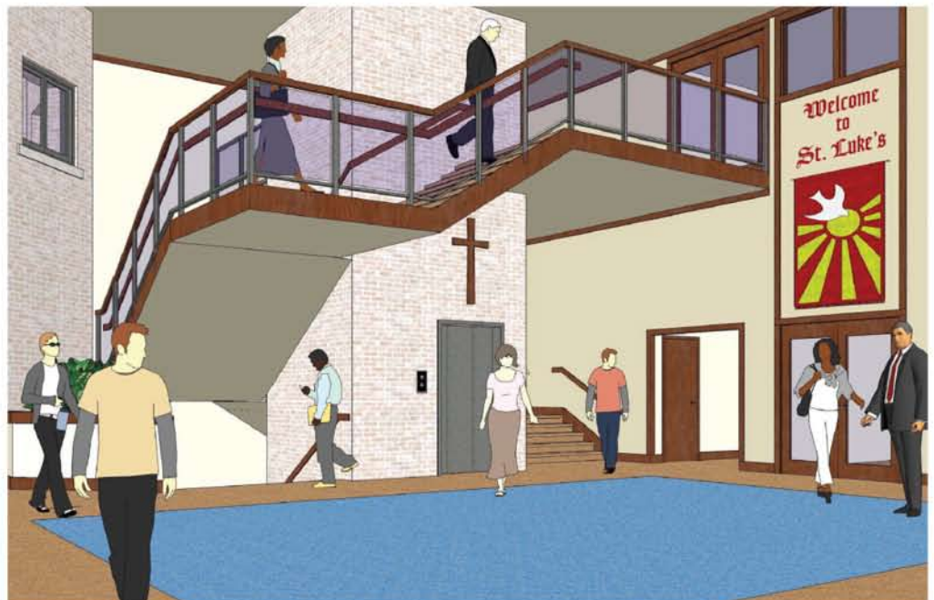
Architect's Perspective of Proposed Main Floor Atrium & Convocation Space